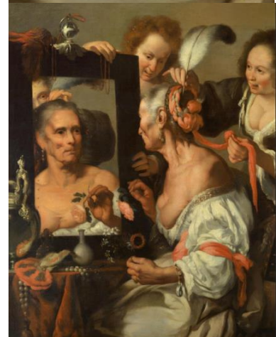
Bernardo Strozzi, Vanitas (c.1637), Pushkin Museum